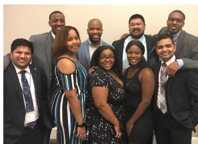
On September 23, 2017, Kappa Psi Pharmaceutical Fraternity Brothers from PCOM and Mercer University gathered in Jacksonville, FL for the Southeastern Province bi-annual convention.