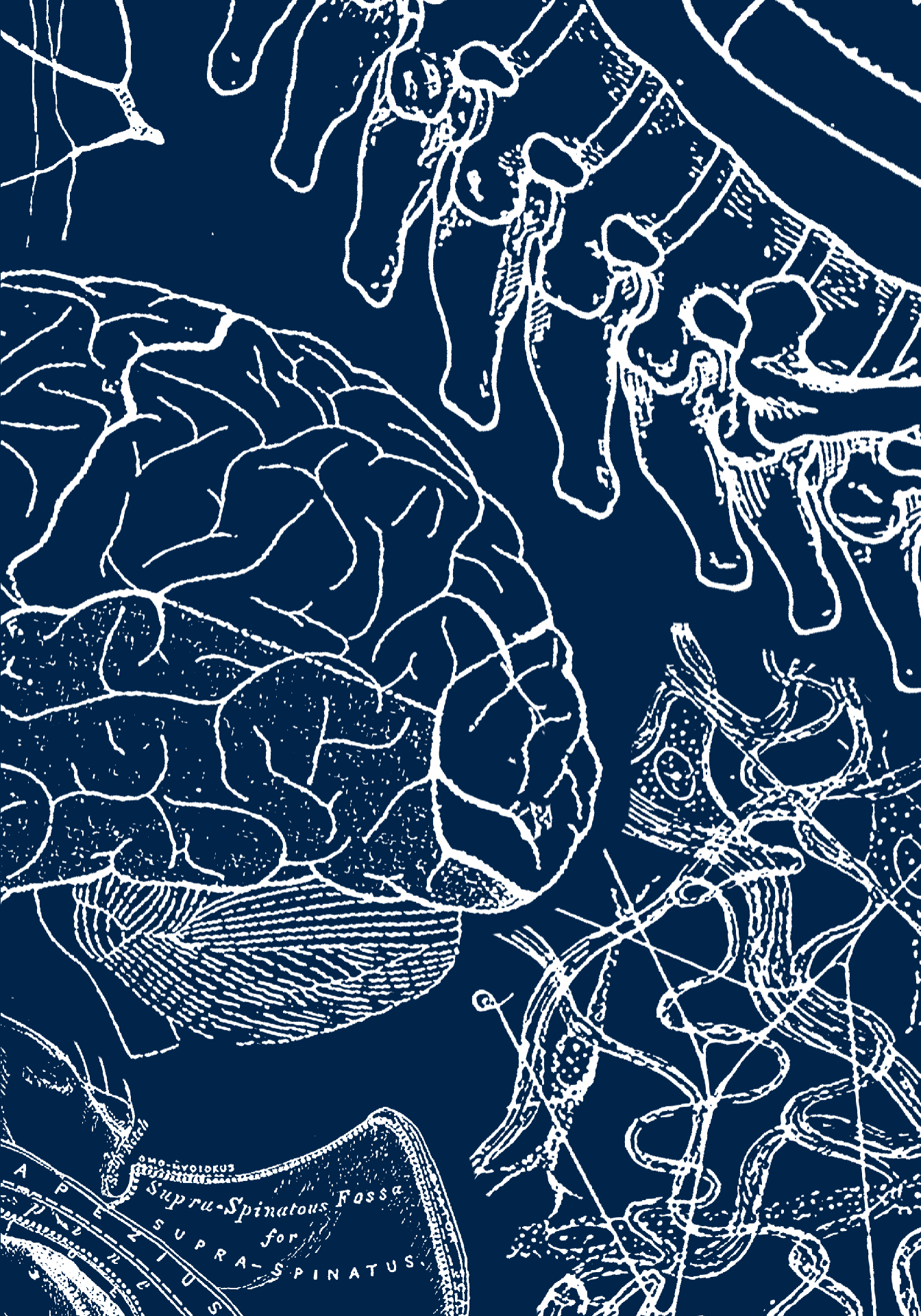
APPEZZIUS Supra-Spinatus Rossa for SUPRA-SPINATUS